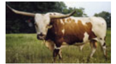
DON JUAN OF CHRISTINE