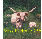
MISS REDMAC 256